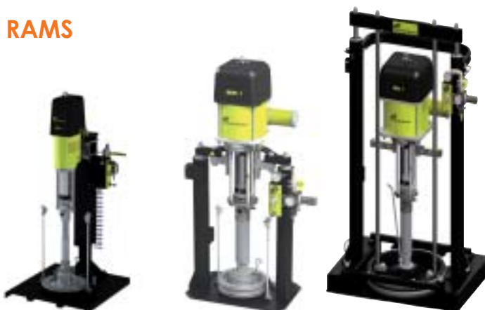
Single post ram for 20-30 litres drums